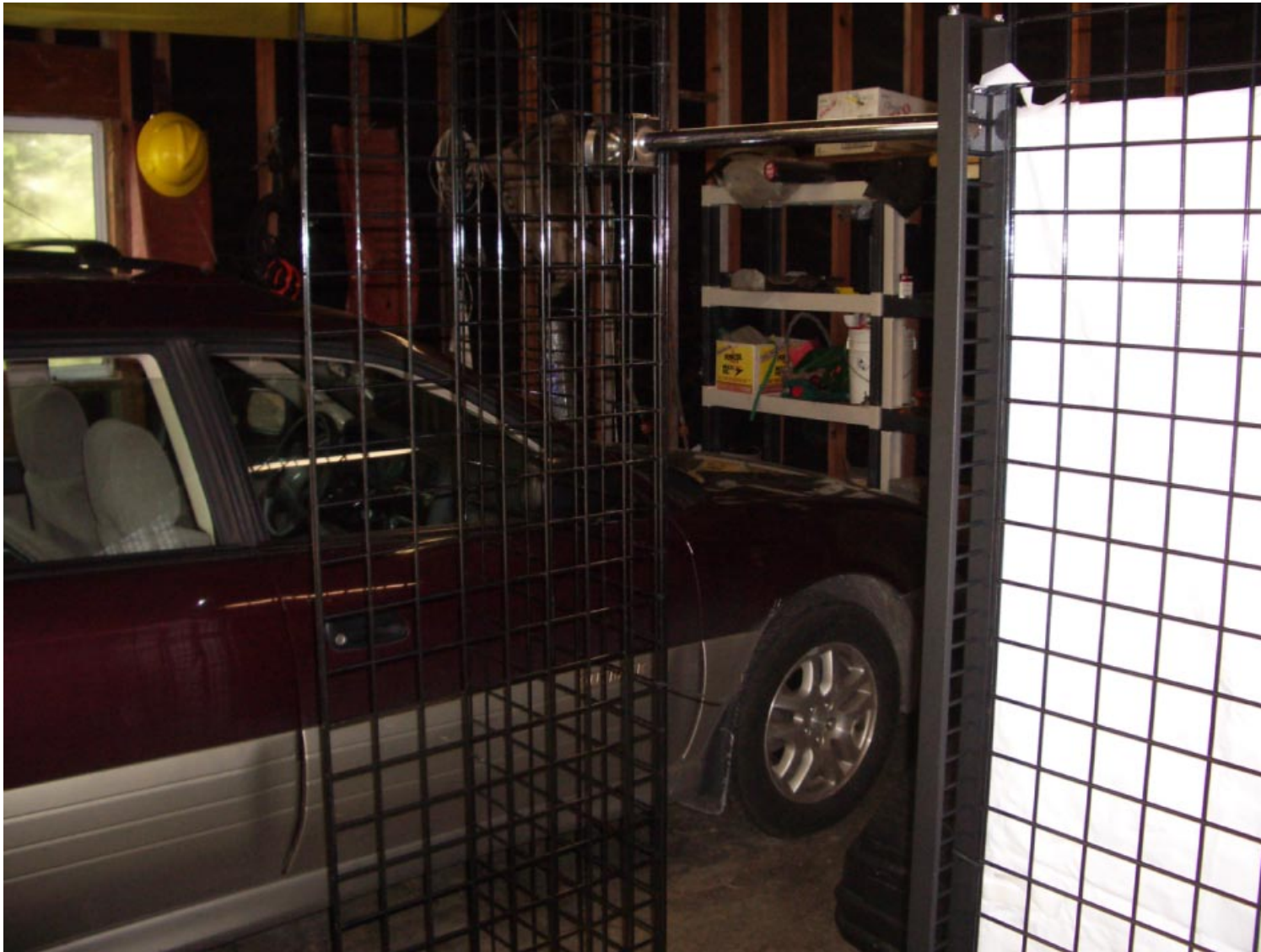
End of Left Wall showing grids in a right angle arrangement at Front of Booth. This corner uses 2 7 foot grids.