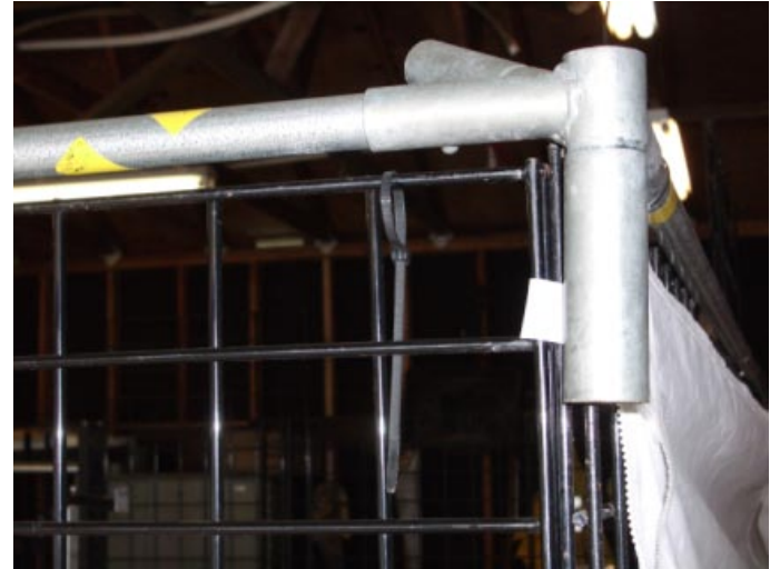
Use Tent Corner Joint for second pole for other wall.