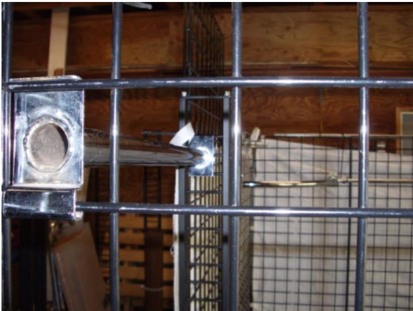
Close up of the Chrome bar that fits the blank grid space.