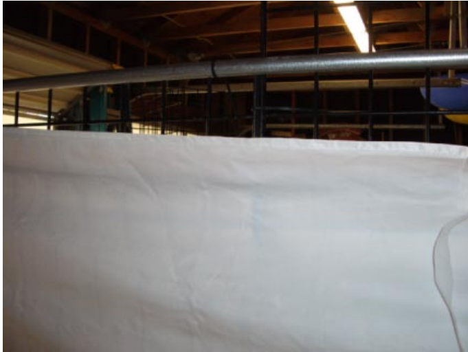
Use Tent poles to correct wall wobble.