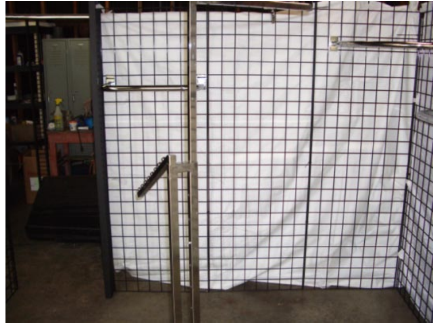
This is the Left Wall again with some Chrome hardware on it. Note the straight Chrome bar in the left corner