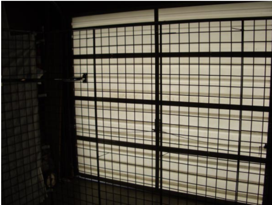
This is the Right Wall. It is a straight wall with a 7 foot grid at the end.